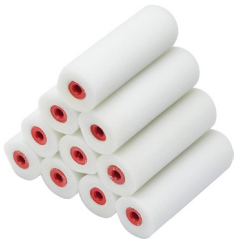
10PK 4" HD FOAM MINI ROLLERS PRODUCT CODE: PRRE036