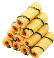
10PK 4" TIGER MEDIUM PILE MINI ROLLER PRODUCT CODE: PRRE040