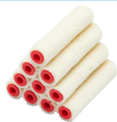
10PK 4" GLOSS PILE MINI ROLLER PRODUCT CODE: PRRE038