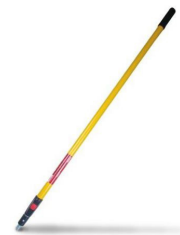
4' - 8' BUTTON LOCK EXTENSION POLE PRODUCT CODE: PREX004