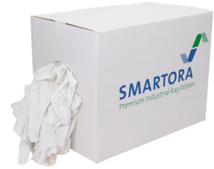
WHITE T-SHIRT WIPERS PRODUCT CODE: WCH10