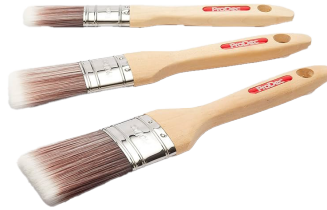
PREMIER OVAL SYNTHETIC BRUSH SET (QTY3) PRODUCT CODE: PBPT055