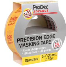
36MM X 50M PRECISION EDGE MASKING TAPE PRODUCT CODE: ATMT002