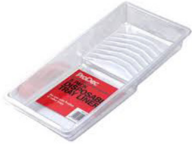
5PK PLASTIC LINERS FOR 4" TRAYS PRODUCT CODE: MRTLINER