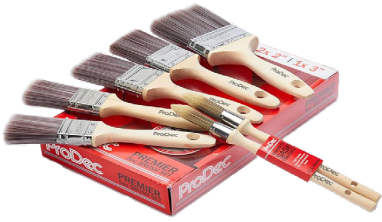
PREMIER FLAT SYNTHETIC BRUSH SET (QTY 7) PRODUCT CODE: PBPT049