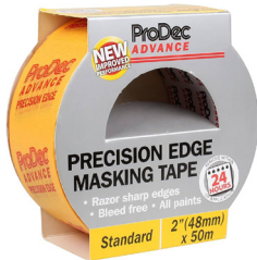
48MM X 50M PRECISION EDGE MASKING TAPE PRODUCT CODE: ATMT003